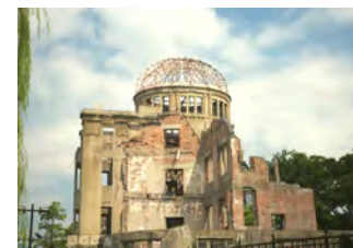
Hiroshima Peace Memorial

Cultural Experience Program (Optional) Individual Trip (Optional)