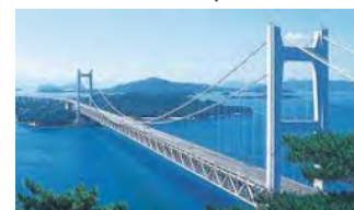
Seto Ohashi Bridge