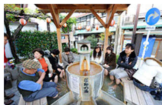
Public Footbath "Yakushi no Yu"

Institute for Planetary Materials, Okayama University Misasa Onsen Environment and Society (Session 5)